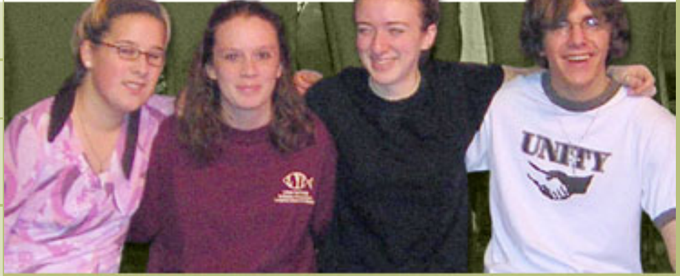
Pictured: 2004-2005 LYF officers

SWIM, Open Space, Welcoming Resolution, Elections Highlight LYF Assembly